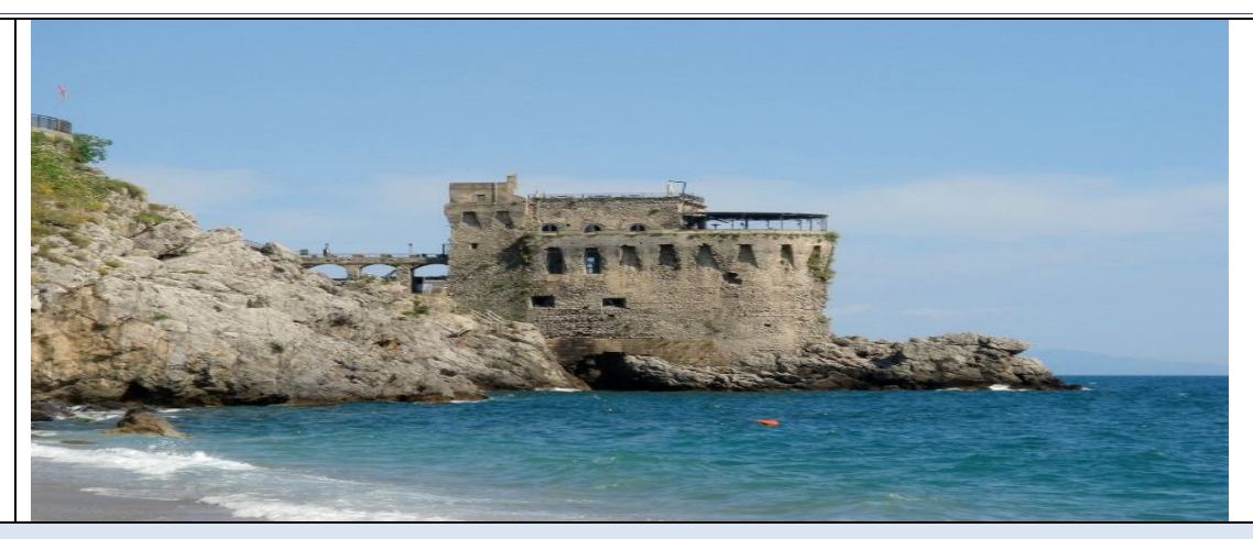
Tuesday 26 May